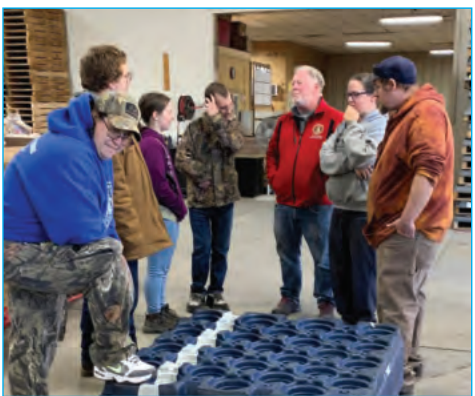
Workshop services include contracts with individual businesses which include everything from small local firms to national corporations.

It's a formula that is a proven winner for Missouri and Missourians.